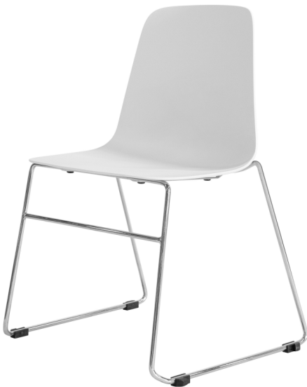
BRINDLEY-O W.600 D.530 H.840 mm Shell W.500 D.450 H.400 mm