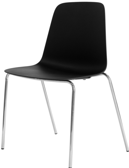
BRINDLEY-U W.560 D.500 H.820 mm Shell W.500 D.450 H.400 mm