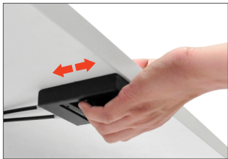
Lift Up Mechanism