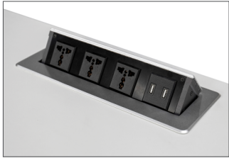
Pop Up Electrical Outlets (Powers and USB Chargers)