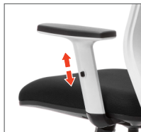
Height Adjustable Armrests