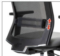
Adjustable Lumbar Support