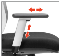
3D Adjustable Armrests