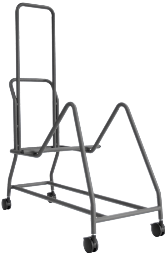
CHAIR TROLLEY W.580 D.1400 H.1380 mm