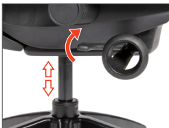
2 Gas Lift (Approx. 60 mm)