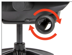
3 Tilt Mechanism