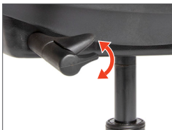
1 Back Lock (3 Steps)