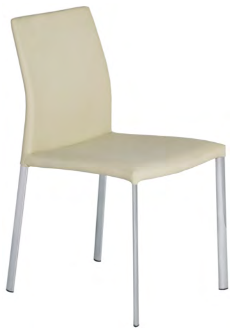
PEARL W.450 D.530 H.840 mm