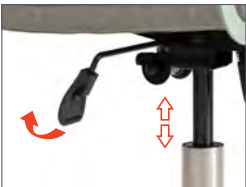
2 Gas Lift (Approx. 9 cm)