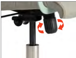
3 Tilt Mechanism