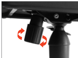
3 Tilt Mechanism