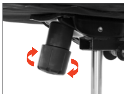
3 Tilt Mechanism