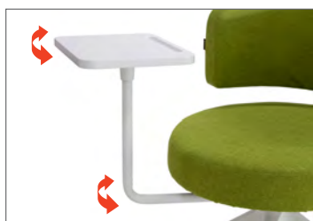
Swivel Lecture Tablet