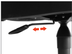
1 Back Lock (3 Steps)

BLOOM-V W.660 mm D.610 mm H.870 mm Backrest W.420 H.450 mm Seat W.450 D.480 mm