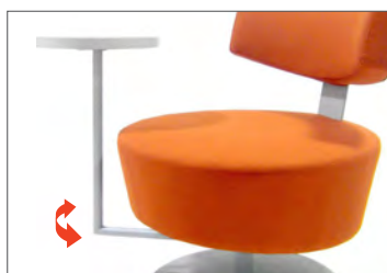
Swivel Tablet Arm

Particle Board: European Standard EN438-2