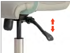
1 Back Lock (Any Angle)

DELL-V DELL-VS with Tattoo Studs W.550 mm D.620 mm H.755 mm Backrest W.440 H.390 mm Seat W.440 D.440 mm