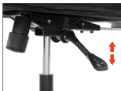
1 Back Lock (Any Angle)