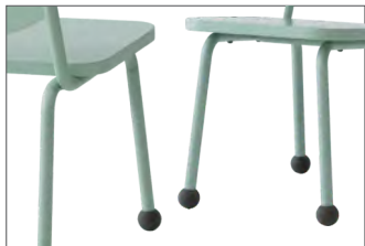
Anti-slip Leg Caps

ML1: Cherry, Beech, Dark Oak, Cappuccino, Maple, Beige, Black ML2: White, Light Grey, Dark Grey HPL: Cherry, Beech, Dark Oak, Cappuccino, Maple, Beige, Black, White, Light Grey, Dark Grey Epoxy: White, Light Grey, Dark Grey, Black, Silver, Mustard Yellow, Sandstone Orange, Jade Green Silicone Rubber: Light Grey, Dark Grey, Yellow