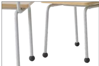
Anti-slip Leg Caps

ML1: Cherry, Beech, Dark Oak, Cappuccino, Maple, Beige, Black ML2: White, Light Grey, Dark Grey HPL: Cherry, Beech, Dark Oak, Cappuccino, Maple, Beige, Black, White, Light Grey, Dark Grey Epoxy: White, Light Grey, Dark Grey, Black, Silver, Mustard Yellow, Sandstone Orange, Jade Green Silicone Rubber: Light Grey, Dark Grey, Yellow