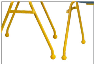
Anti-slip Leg Caps

Epoxy: White, Light Grey, Dark Grey, Black, Silver, Mustard Yellow, Sandstone Orange, Jade Green Silicone Rubber: Light Grey, Dark Grey, Yellow