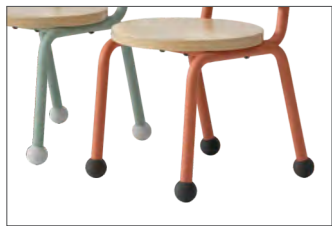
Anti-slip Leg Caps

COLOUR ML1: Cherry, Beech, Dark Oak, Cappuccino, Maple, Beige, Black ML2: White, Light Grey, Dark Grey Spray Paint: Light Grey, Beige, Black, Mustard Yellow, Sandstone Orange, Jade Green Epoxy: White, Light Grey, Dark Grey, Black, Silver, Mustard Yellow, Sandstone Orange, Jade Green Silicone Rubber: Light Grey, Dark Grey, Yellow